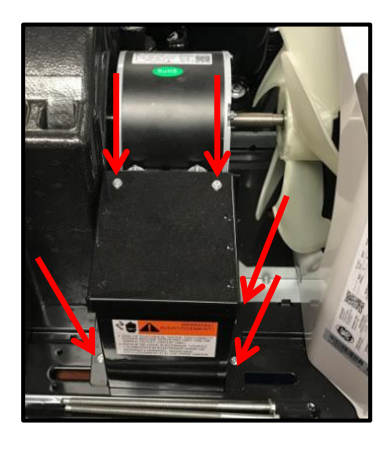
Step 7 – Mount the EasyStart system to the metal capacitor enclosure with zip-ties, bundle and secure extra EasyStart wiring, see photo below...